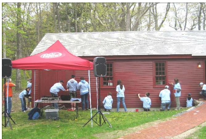
The 'Pepsi Painters of Portland' with a little help from Dr. Pepper and a lot of red paint, covered the entire Winn House on Saturday, May 14 in 4 hrs flat, ahead of the rain.