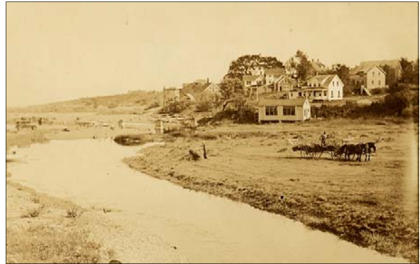
Turn of the century (Late 1800s to early 1900s) views of the old bridge (top) and 'loadin' up hay on the maash.'